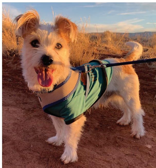
From this issue forward the Messenger will turn the camera to Zuni's Pets and Animals. Keep an eye out for familiar tails!